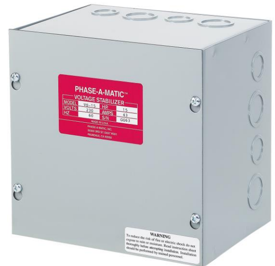
Model VS-15 Shown