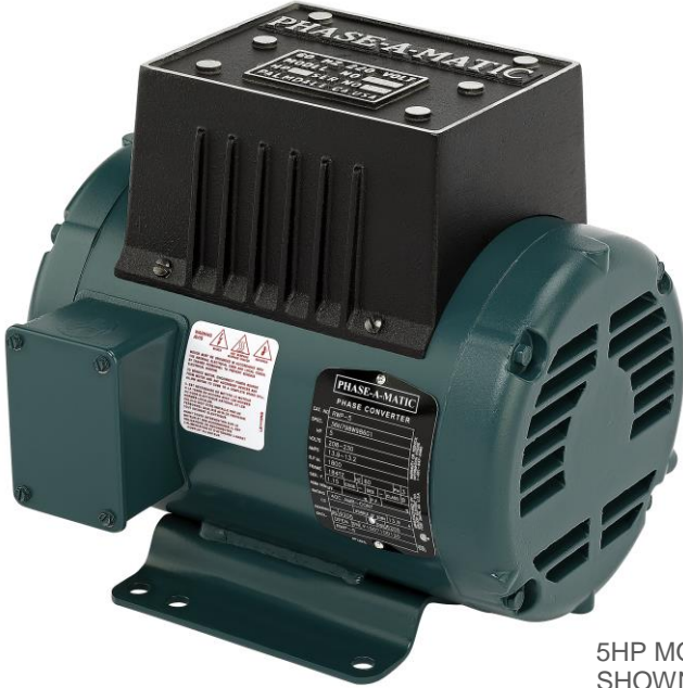
5HP MODEL SHOWN

FULL POWER Phase Converter runs 3-phase equipment from single-phase power source at full power.